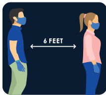
Keep your physical distance from others – stay in your bedroom, use separate bathrooms.

People who are isolated or quarantined should take the following actions to keep themselves and others safe: