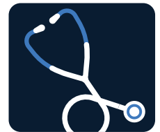
Home care for someone who is sick with COVID-19