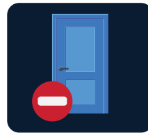
Do not allow visitors to your home.