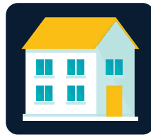
Do not leave your home (unless necessary for medical care).