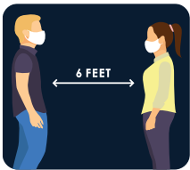
Standing within 6 feet for 15 minutes