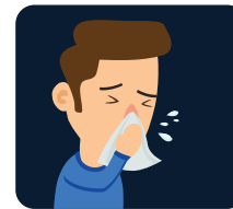
A nearby sneeze or cough