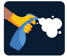
Wipe down high-touch areas every day with a disinfectant.

Go to coronavirus.ohio.gov for more information.