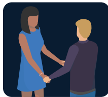
Direct physical contact