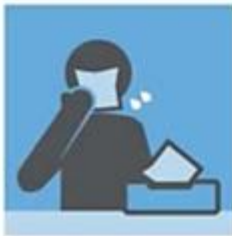
COVER YOUR MOUTH WITH A TISSUE OR SLEEVE WHEN COUGHING OR SNEEZING