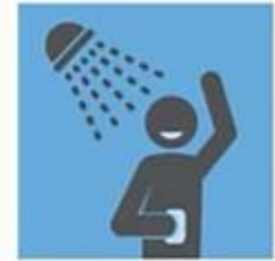
PRACTICE GOOD HYGIENE HABITS

For more information, visit: coronavirus.ohio.gov