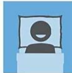
GET ADEQUATE SLEEP AND EAT WELL-BALANCED MEALS