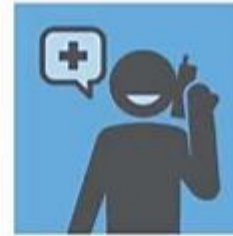
CALL BEFORE VISITING YOUR DOCTOR