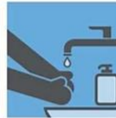
WASH HANDS OFTEN WITH WATER AND SOAP (20 SECONDS OR LONGER)