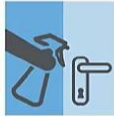
CLEAN AND DISINFECT "HIGH-TOUCH" SURFACES OFTEN