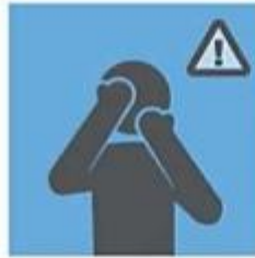
AVOID TOUCHING YOUR EYES, NOSE, OR MOUTH WITH UNWASHED HANDS OR AFTER TOUCHING SURFACES