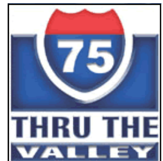
The I-75 widening project is one of several projects slated for I-75.

2009, it is already generating a lot of excitement in the City of Middletown. The project promises changes to the existing exit ramp configuration and improved traffic flow along 122 and the fast growing area around Towne Mall and the new Middletown Regional Hospital.